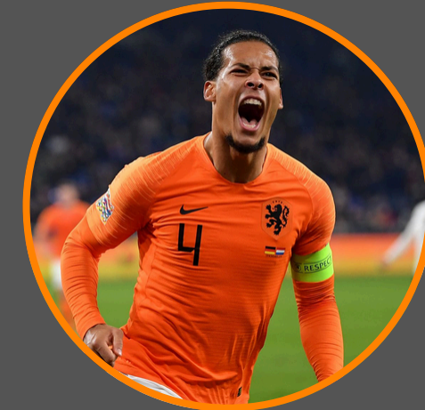
VIRGIL VAN DIJK