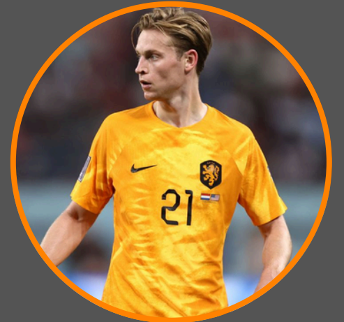
FRENKIE DE JONG